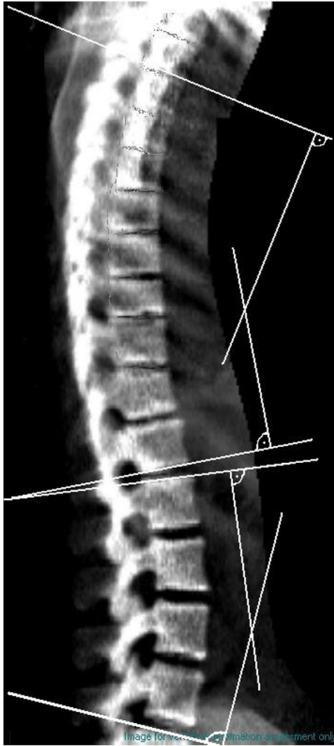
Fig. 2 – Lateral view of the spine on track and field athlete participant.

( 5.7 \pm 4.7^\circ for men; 8.7 \pm 5.9^\circ for women) angle values. There was also no correlation between the age of starting regular trainings and both thoracic kyphosis and lumbar lordosis angle values.